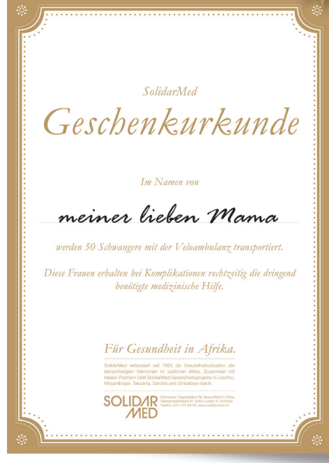
An example of a bicycle ambulance gift certificate ( in German)