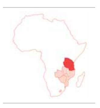
Tanzania: Inhabitants 49'253'000 Doctors per 1'000 inhabitants 0,03 Life expectancy 63 years

Now she sits on a round wooden stool holding her four week old baby. After a friendly greeting, Tadei Pulapula sits down opposite and pages through his information booklet until he reaches a colourful illustration of a breastfeeding woman. Today he will discuss with Theresia why breastmilk protects her baby from infections.