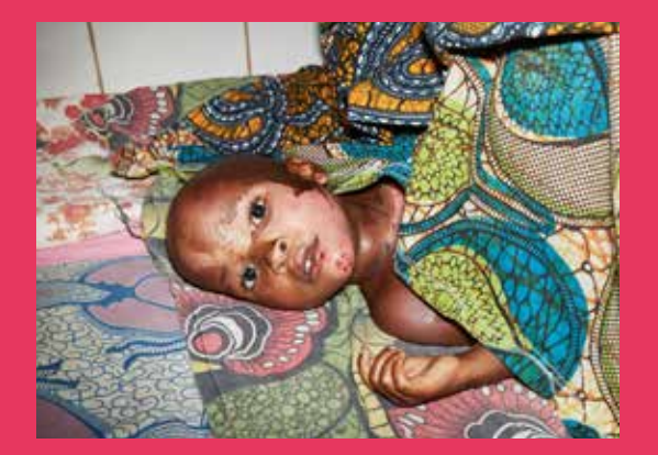
Thanks to the red card, the severe burns in Rebeka's face were treated immediately.