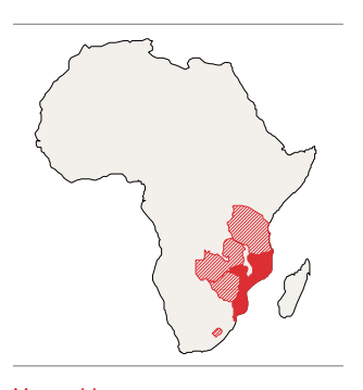
Moçambique: Inhabitants 28'829'000 Doctors per 1000 inhabitants 0,055 Life expectancy 59

Children who require urgent medical assessment receive a yellow card. Patients whose ailment is not acute and whose condition does