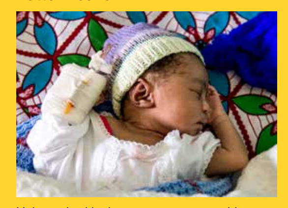
Moira arrived in the emergency room with a very high fever. Malaria was suspected and this needed to be investigated quickly.