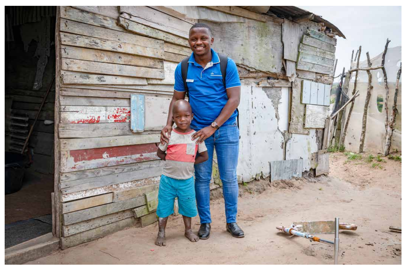
▲ HIV/AIDS affected families in the informal settlements of East London (South Africa) are not left to suffer alone with their concerns and needs, but rather are aided by social workers. mr

The tradition-steeped Aids & Child Foundation joins SolidarMed. The existing activities for children and adolescents affected with HIV/AIDS in South Africa, Kenya and India are continuing. A stroke of luck for both organisations.