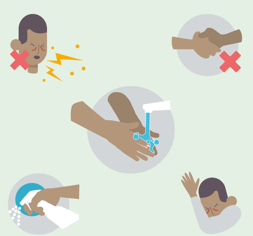
▲ In Lesotho, flyers are used to indicate the correct behaviour in times of Covid-19. pma