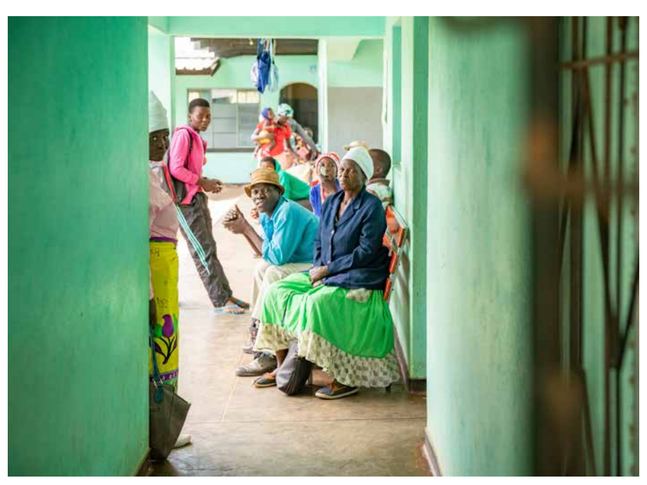
▲ The friendship benches in the health care centres counteract the stigma of mental illnesses.