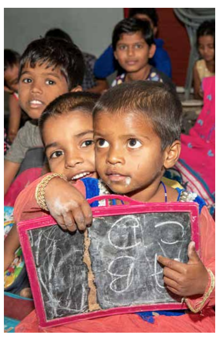
▲ Ensuring schooling of HIV-affected children in Hyderabad. mr

The home visits of our social workers also a play a central part in a project in the industrial city of East London. Since only in the safety of their own four walls do these people reveal the closely guarded secret of their HIV infection. In order to get through to these people, our local partner organisation works together with a government primary school. Distributing breakfast to the 800 pupils, regular private tutoring, offering individual advice, health check-ups and a day care centre improve the children's future opportunities.