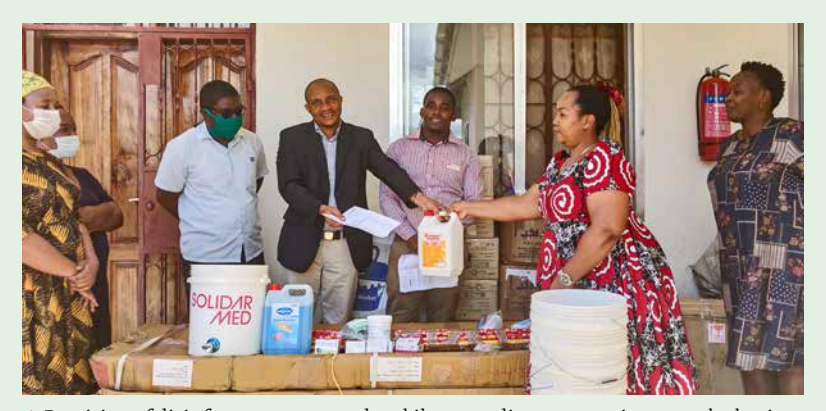
▲ Provision of disinfectants, soap, and mobile water dispensers to improve the hygiene conditions in Tanzania. pma (picture made available)