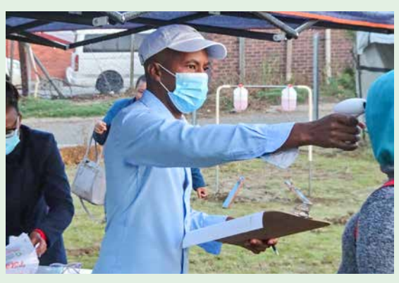
▲ Temperature-taking as part of the Covid-19 screenings in Lesotho. pma