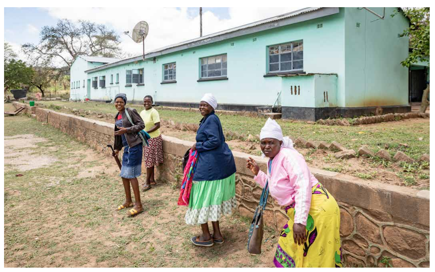
lacktriangle Grandmothers in Zimbabwe: Talk therapy for people with psychological problems. mh