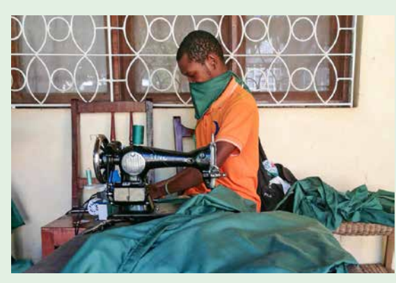
▲ Unconventional situations require unconventional measures: masks are produced in Mozambique. pma