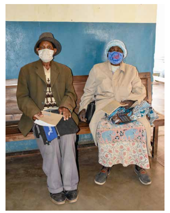
▲ The corona virus has become an inescapable part of everyday life, including in Southern and Eastern Africa. pma

The wide-ranging consequences of Covid-19 can already be perceived in many African countries. Many people in these countries already suffer from underlying diseases such as malaria or tuberculosis. The local economy has been severely weakened by the measures to contain the virus.