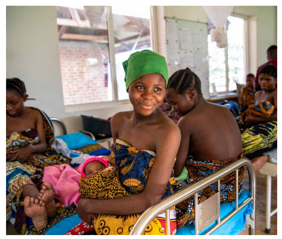
▲ Given the growing need, beds are already lacking in the premature infants ward. rl

As soon as a baby has reached the required birth weight, its lung function has developed enough and its condition is determined to be stable, the women and their children return to the village community.