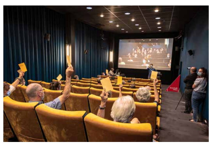
▲ The voting was able to be carried out with the required social distancing.

The next annual general meeting, complete with an exciting supporting programme, is scheduled for Friday, 18 June 2021.