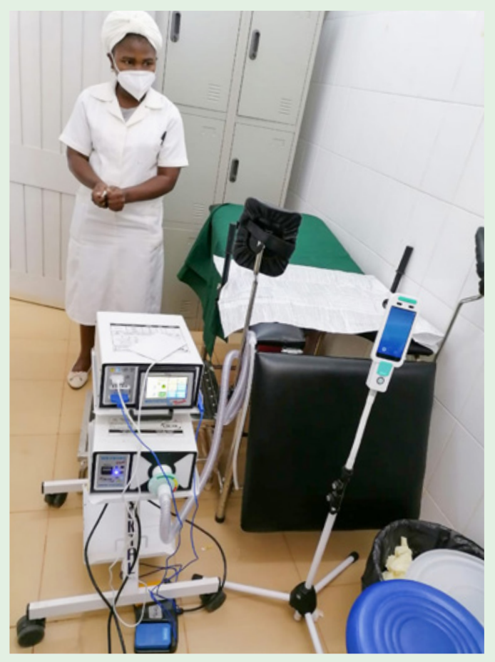
A nurse in a gynaecological examination room set up by SolidarMed. pma

SolidarMed will continue to campaign for the health of women in rural areas of Mozambique because HPV tests are still not routinely carried out. Dialogue with the health authorities will remain important. SolidarMed is also planning to extend the project to Zimbabwe and Tanzania.