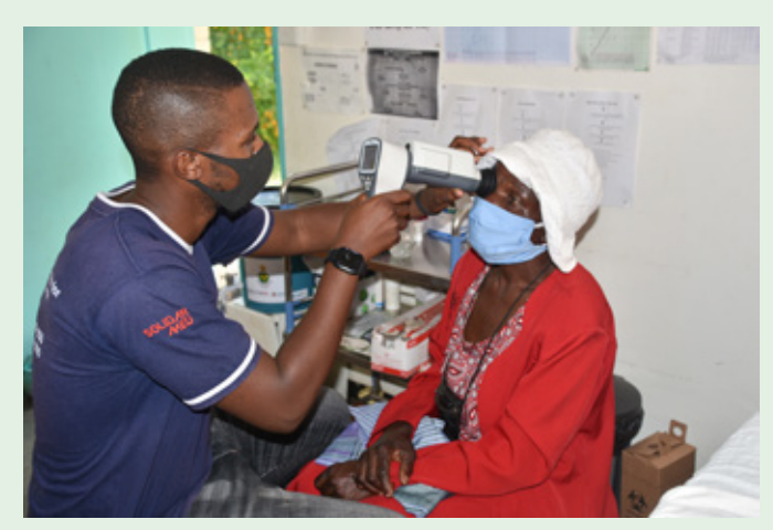
▲ A patient is screened for diabetic retinopathy at Masvingo Hospital. Charmaine Mhondiwa